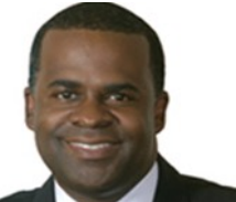
Kasim Reed Atlanta, GA Phone: 404/330-6100 Next General Election: 11/5/2013