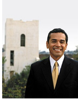
Organizational Leader Next General Election Termed out 3/5/2013 President Mayor Antonio R. Villaraigosa Los Angeles, CA Phone: 213/978-0600