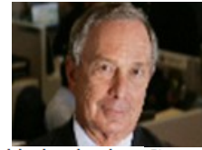
Michael R. Bloomberg New York, NY Phone: 212/788-3000 Next General Election 11/5/2013