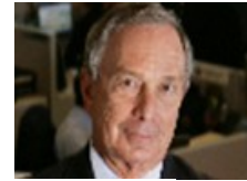
Michael R. Bloomberg New York, NY Phone: 212/788-3000 Next General Election 11/5/2013