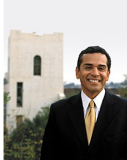
Organizational Leader Next General Election Termed out 3/5/2013 President Mayor Antonio R. Villaraigosa Los Angeles, CA Phone: 213/978-0600

THE UNITED STATES CONFERENCE OF MAYORS The Voice of America's Mayors in Washington, DC